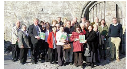
Launch of South Tipperary Heritage Plan

WEB SITES: Two new Web sites developed by Community & Enterprise in conjunction with the South Tipperary Heritage Forum with support of South Tipperary County Council Information Technology section, went live in March 07 1. www.southtipperheritage.ie - a portal- type heritage web site for South Tipperary with links to other agencies etc involved in heritage in the county 2. www.riversuir.ie - a website to promote awareness and appreciation of the River Suir This is an action of the South Tipperary Heritage Plan.