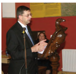
Minister Ó'Cuív at the launch of the newly refurbished Heritage Centre

A section of the building has been designated exclusively as an ICT training facility and to accommodate multimedia presentations. The County Enterprise Board has supplied twenty state of the art ICT workstations to the centre. Various training programmes are in place, including 'Small Business Management for Women' and computers have been provided for the Internet café facility. The provision of broadband Internet access facilities is a potential source of revenue and has increased usage of other services in the centre. An exhibition re: Derrynaflan Hoard has been secured from the County Museum and is displayed in the centre.