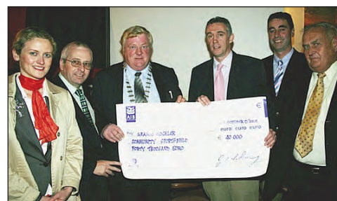
Presentation of Scheme of Capital Grants cheque to Grangemockler Community Sports field

The Social Inclusion Measures Group of the County Development Board, and its sub-groups, continued their work of seeking to create more effective and efficient social inclusion actions. A grant for actions involving migrant workers was secured from the Department of Social and Family Affairs for an art project and another grant to the Single Parents group will allow for the collection of data on the numbers of, and issues facing, single parents in the county. This data will feed into the Cohesion Board plans for social inclusion in the county. The Early School Leaving group have continued to collect data in preparation for an application for a county-wide mentoring project for disconnected youth. The Safety and Security Partnership has met on several occasions to discuss issues of concern including bonfires and a number of initiatives have been undertaken to address key areas of concern such as anti-social behaviour and estate design. In addition the Social Inclusion Measures group has reviewed its working method and procedures.