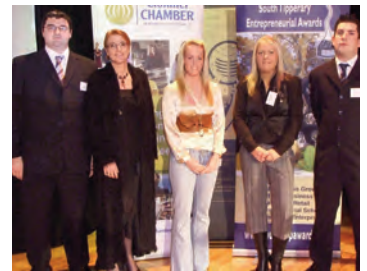
Finalists: Best New business