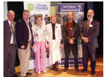
Finalists: Best Community Enterprise