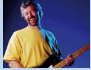
Eric Clapton Tribute 26th September

For more details contact Tipperary Excel Box Office on 062 80520