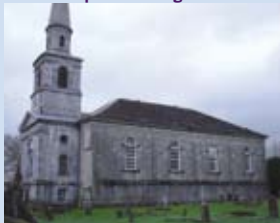
Cathedral of St. John the Baptist, Cashel, Co. Tipperary

10th July Reception & Organ Recital 11th July Lectures in Cashel Palace Hotel, Festival Dinner 12th July Guided Tours of Cashel Town, Festival Service by Church of Ireland Archbishop of Armagh and Primate of All Ireland. Combined Cathedral Choirs of Cashel, Waterford & Lismore and the Tipperary Singers. Bolton Library Exhibition, Flower & Photographic Display (Weekend)