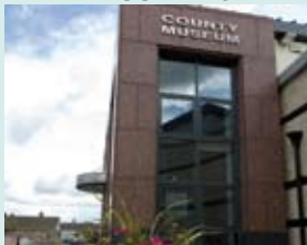
South Tipperary County Museum

First founded in the 1940's, this purpose-built County Museum is located in the heart of Clonmel's civic centre. The collection is representative of the archaeology, art, social, political, military, industrial and folk life of the County. This award-winning Museum is dedicated to education and life-long learning through visiting exhibitions, workshops and community projects.