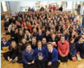
South Tipperary Heritage in the Community Project 2009/2010

Contact: South Tipperary County Museum, Tel: 052 6134550 Email: museum@southtippcoco.ie Web: www.southtippcoco.ie