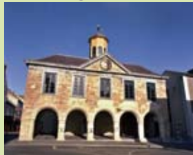
Traditional Food and Farming Day 30th August

Contact: Tipperary Town Council Dan Breen House, Tipperary Town. Tel: 062 80700 Web: www.southtipperheritage.ie Email: www.heritageweek.ie