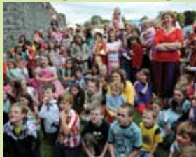
Fethard Medieval Festival 22nd - 23rd August

The festival will be a fun-filled family affair with something for everyone. Paul Brady will be playing music down by the Town Wall on the Saturday night. Sunday will have a variety of activities and events. Other Walled Town Day events will take place in Cashel and Clonmel.