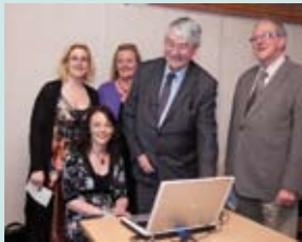
Pictured at the Launch of www.whatsonintipp.ie .