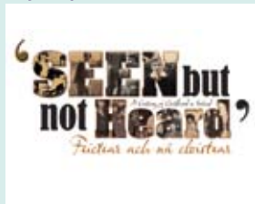
'Seen but not Heard' A Century of Childhood

South Tipperary County Museum won 'Best Education & Community Engagement Initiative' for their Heritage in Schools Project 2009.