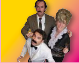
Faulty Towers Dining Experience

The five cafés are: The Canine Café, The Writing Room, Hip Hop/Dance, Café Shrine and The Robinsons' Sunday Roadshow.