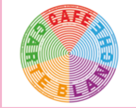
Cafés Carte Blanche

Junction Festival has devised 'Cafés Carte Blanche', a project that undertakes to fill five empty town centre premises. Five artists from differing art forms will be converting these shops into temporary artistic cafés.