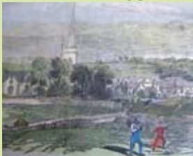
Tipp Hills Raising Appreciation Day 25th August

Contact: The Community Office, Barrack St., Fethard Tel: 052 6131000 Email: info@fethard.com